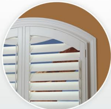
FULL DOWNWARD ROTATION